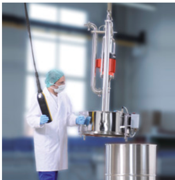
Mobile use with crane or fork lift truck.