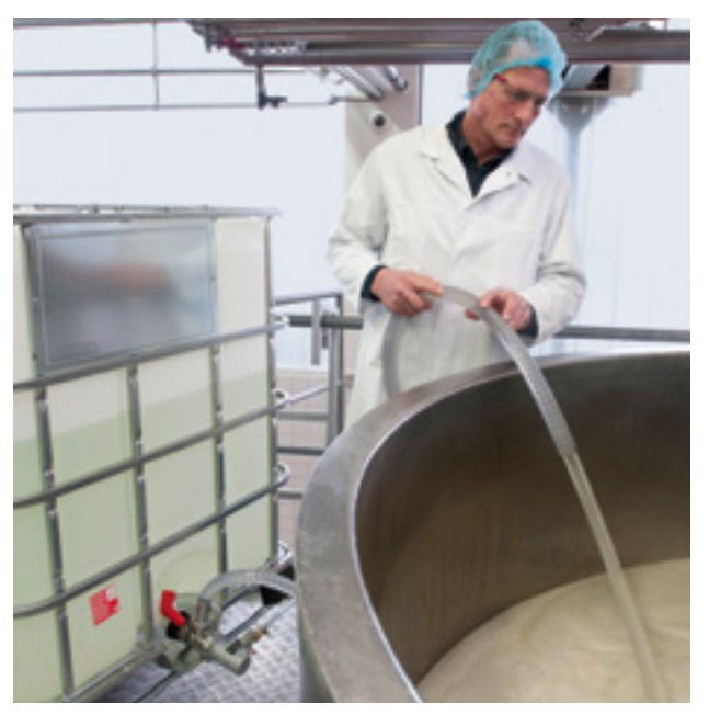
Pumping upward into a mixing container from the IBC outlet.