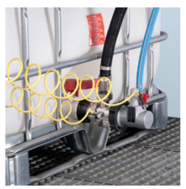
Also suitable for use in explosion hazard areas of zone 1.**