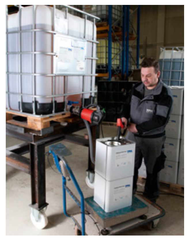
Fast container filling from the IBC outlet.