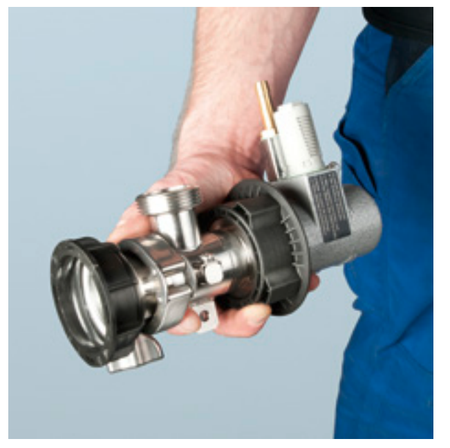
Extremely compact and light.